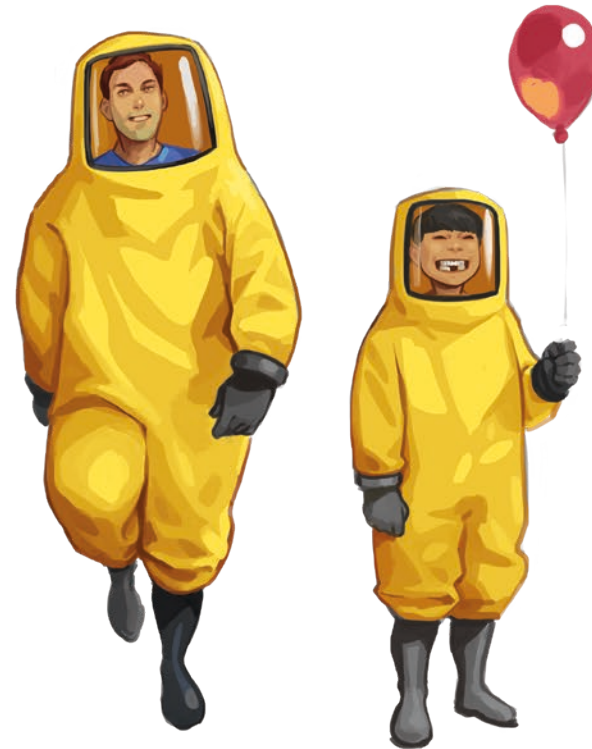
Guests are issued yellow leisure suits on entry to the park.