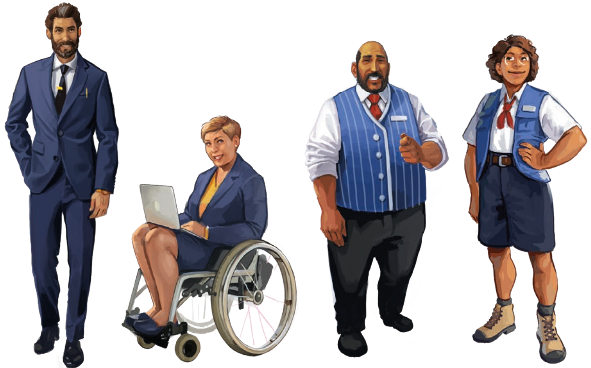
Admin staff who are not guest-facing require presentable office attire.

The bullet points in the notes on each page describe the required items, so that we can keep the look of new staff members consistent with those already working in the park.