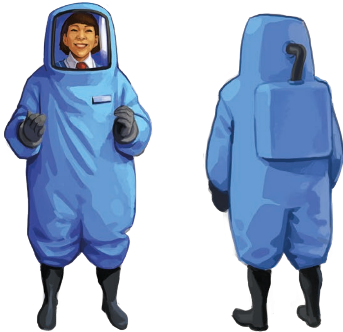
Staff members wear a blue leisure suit over their normal uniform.